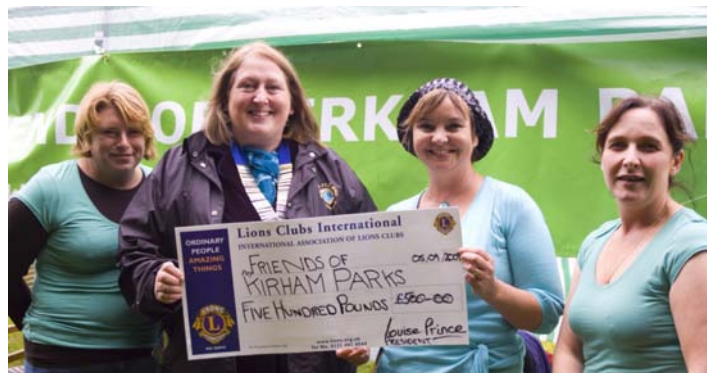
The Kirkham Lions Club presented the Friends of Kirkham Parks with a cheque for £500 at "Fun in the Park" September 2009

Since setting up the Friends of Kirkham Parks in January 2009 we have received a great deal of support from many members of the community in and around Kirkham. Here are just a few examples of how people have been contributing their talents and resources to making the dreams of a new park come true: